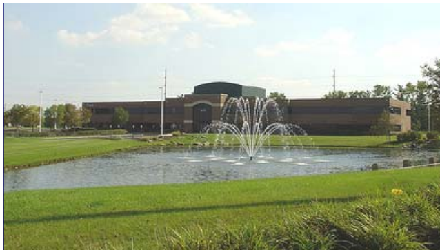
The 2011 NCSS Great Lakes Regional Conference will be at the Quest Business and Conference Center in Columbus, Ohio.